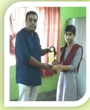
1 st Prize winner Abhivyakti-3