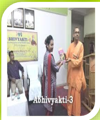
Prize winner Abhivyakti-3