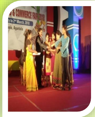
2 nd Prize winner I&C Fair