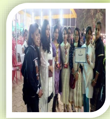
1 st Prize winner I&C Fair