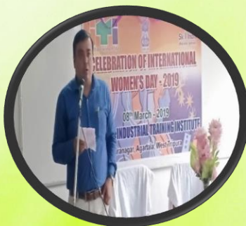
Women's Day Celebration, 2019