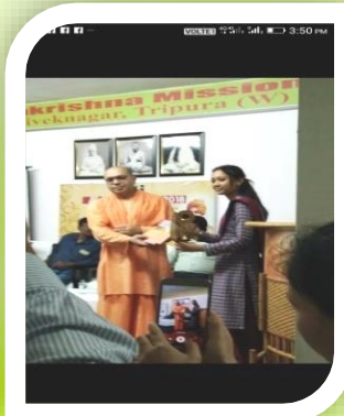
1 st Prize winner Abhivyakti-2