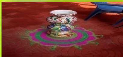
Biswakarma puja celebration