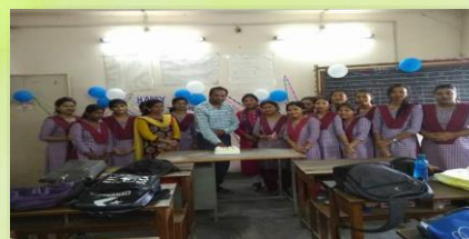
Teacher's Day celebration