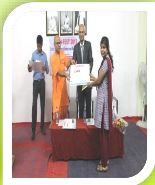
1 st Prize winner Abhivyakti-1